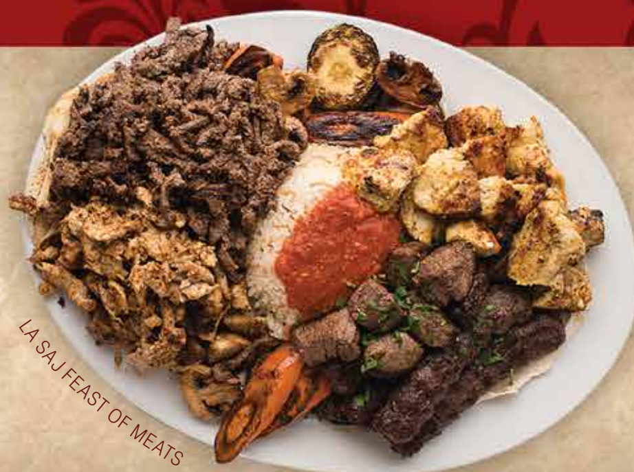
LA SAJ FEAST OF MEATS

LA SAJ COMBO Beef kabob, chicken kabob, kafta, fried kibbee, falafel and grape leaves. For Two | 38.99 For Four | 75.99